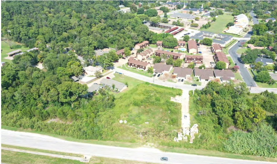
Facing East across I-45