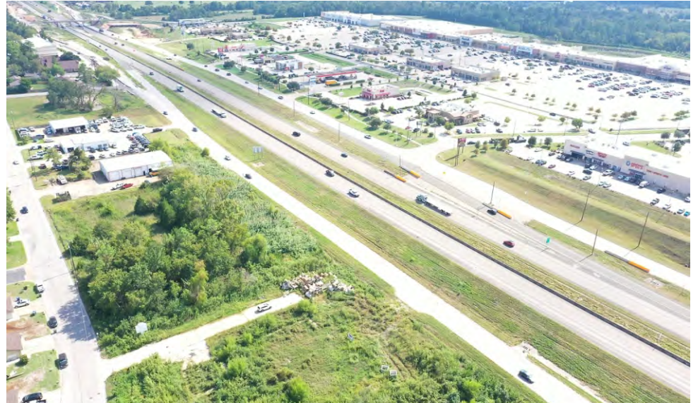
Facing South Along I-45