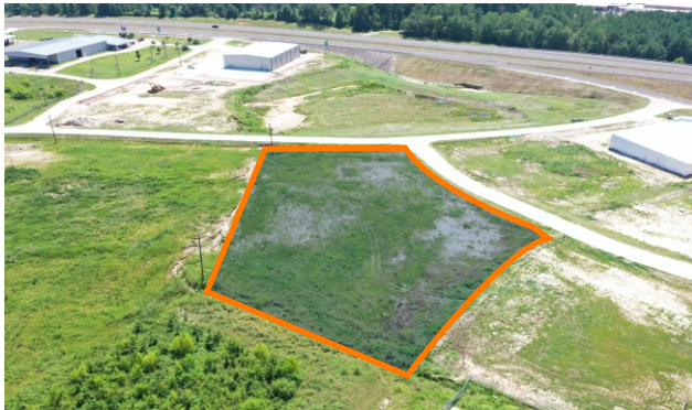
Lot 5R-4 2.04 ac