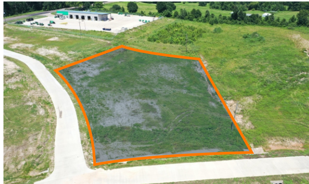
Lot 5R-4 2.04 ac front side