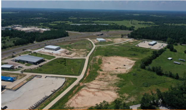
Aerial Photo Facing North along HWY 19