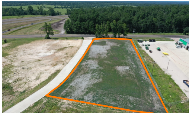
Lot 5R-5 1.90 ac