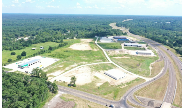
Aerial Photo Facing South along HWY 19