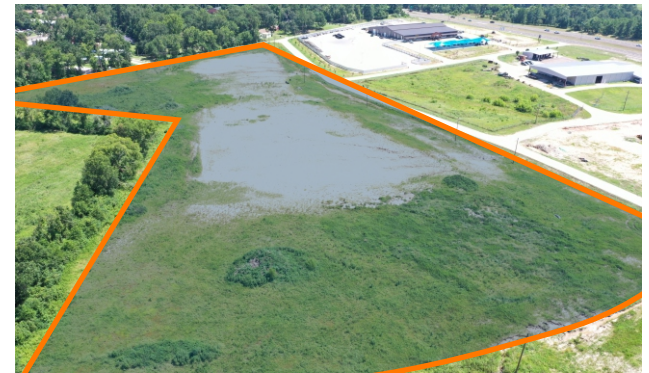
Lot 7 13.77 ac Will Divide