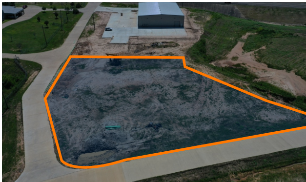
Lot 4R-2 1.63 ac