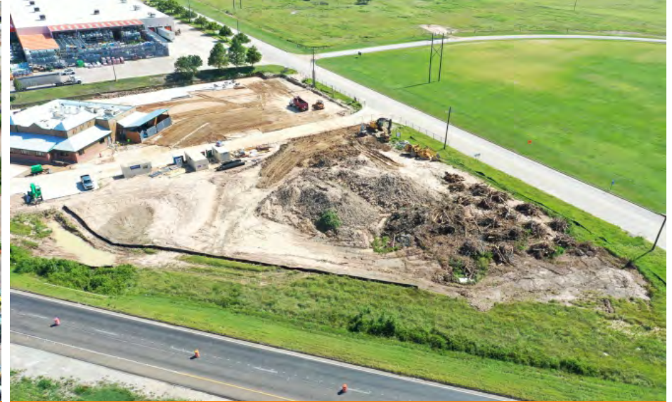
Facing West Along Veterans Memorial