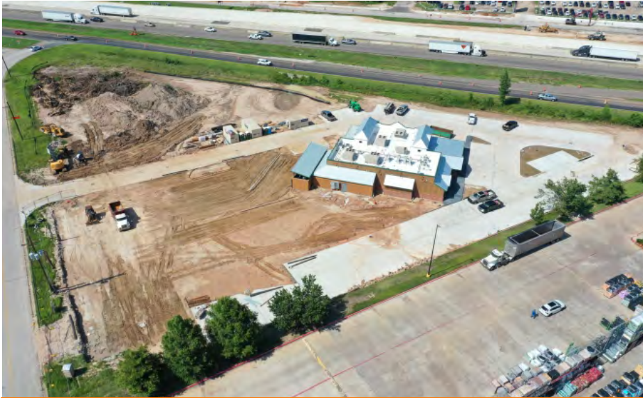
Facing East Towards I-45