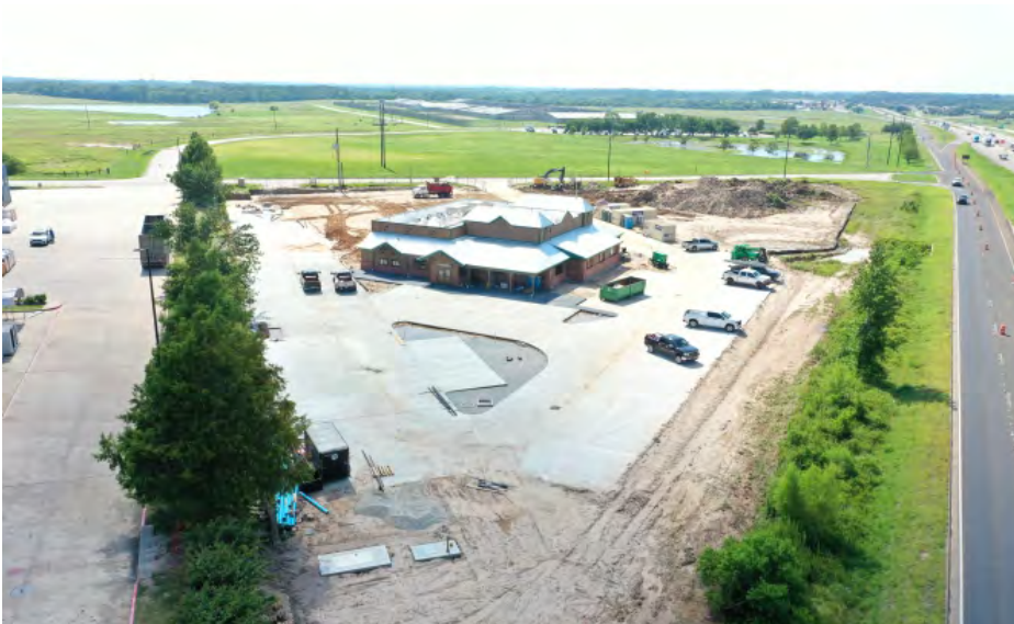
Facing North Along I-45